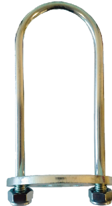
Suspension Hook to hang from silo rafters

We also have systems for suspension inside the bins, where the Sensor Cables are hanging from the roof rafters or from steel wires suspended under the roof. (Ask for our suspension application info).