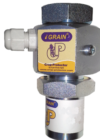
iGrain Sensor Cable Head